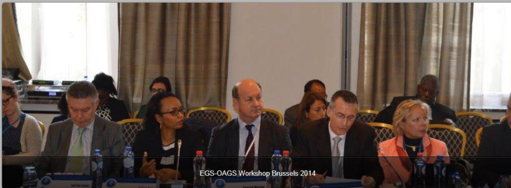
EGS-OAGS Workshop Brussels 2014