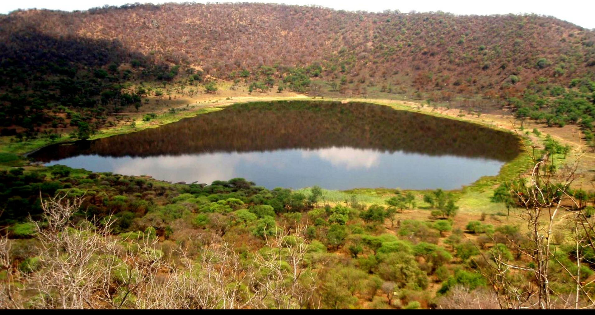
Geological Society of South Africa is promoting establishment of Africa's first Geopark at the Tswaing Meteorite Impact Crater